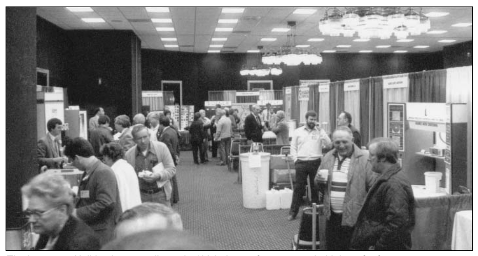
The Lawrence Holiday Inn was all new in 1984; the conference was held there for four years before moving to Salina.

503 regulations were new terms added to the KRWA's glossary of assistance. Electrical reviews continued to gain in popularity. As part of the State Water Plan contract for on-site assistance, KRWA